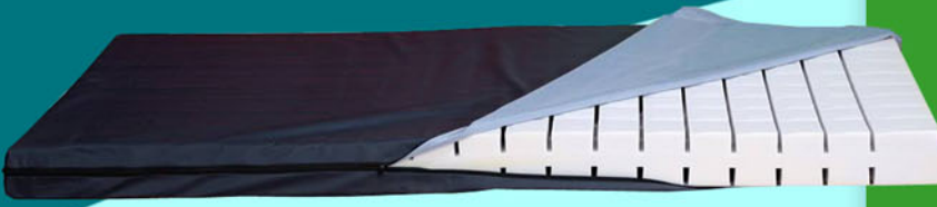
Siensi Cut Patient Bed Sponge MY260-5CM-1