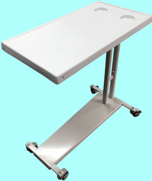
Patient Dining Table MY210