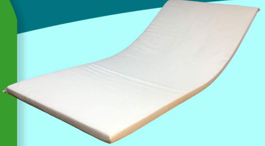
Patient Bed Sponge 5CM MY260-5CM