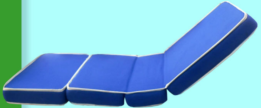
4 Piece Patient Bed Sponge MY260-4P